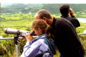
Dodd Wood for Osprey Viewpoint