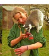
Trotters World of Animals