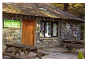
The Old Sawmill Tea Room